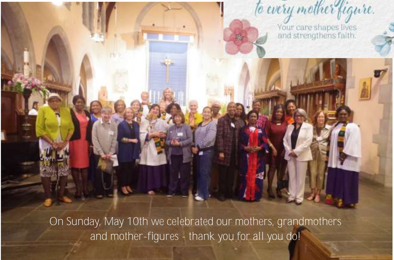
On Sunday, May 10th we celebrated our mothers, grandmothers and mother-figures - thank you for all you do!