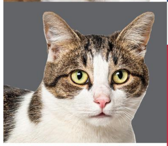
Free pet supplies and food will be available.

Limited Financial Assistance Available for Spay Neuter Surgery