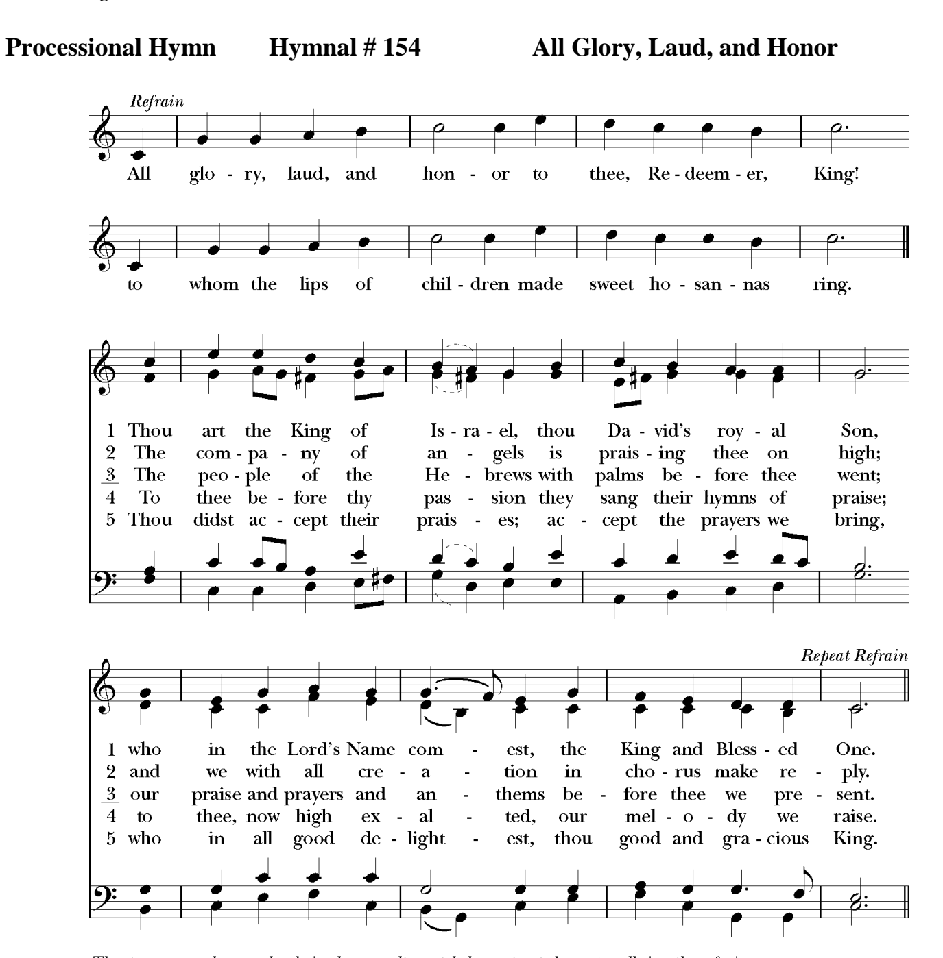
The stanzas may be sung by choir alone or alternately by contrasted groups; all sing the refrain.

All process - Crucifer, Acolytes and Choir – and continue in procession around the Cathedral as we sing.