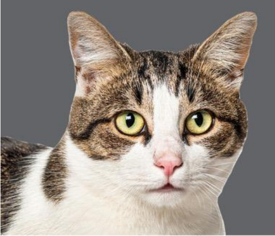
Free pet supplies and food will be available.

Limited Financial Assistance Available for Spay Neuter Surgery