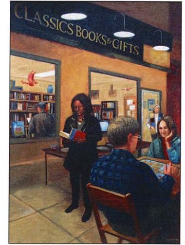
Friday Night, Lafayette Street

(Cover art for The Bookshop on Lafayette Street, available at Classics Books, Downtown Trenton)