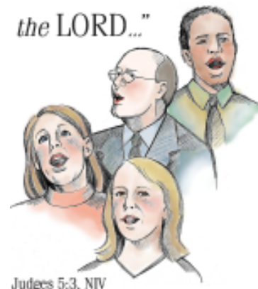
Judges 5:3, NIV

"I will sing to the LORD, I will sing; I will make music to the LORD..."